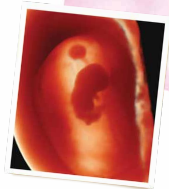
Embryo photo used with permission of GE Healthcare

The heart begins to beat just 21 days after fertilization, or 5 weeks after the mother's last menstrual period began.